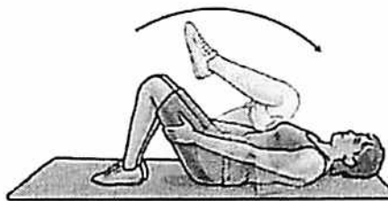
Double knee to chest