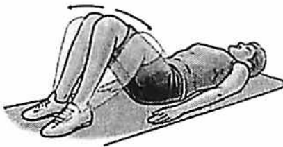
Hip adductor stretch