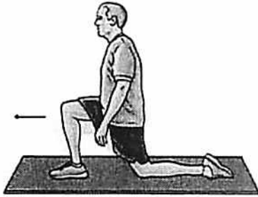
Hip flexor stretch