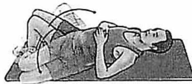
Lower trunk rotation